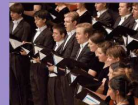
Wheaton College Concert Choir