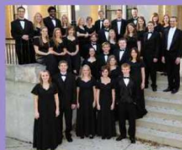
Concordia University Chicago's Kapelle