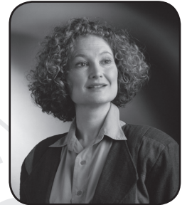
Dame Emma Kirkby